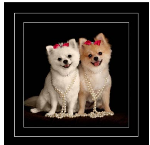
“2 Little Bitches” by Sam Smead